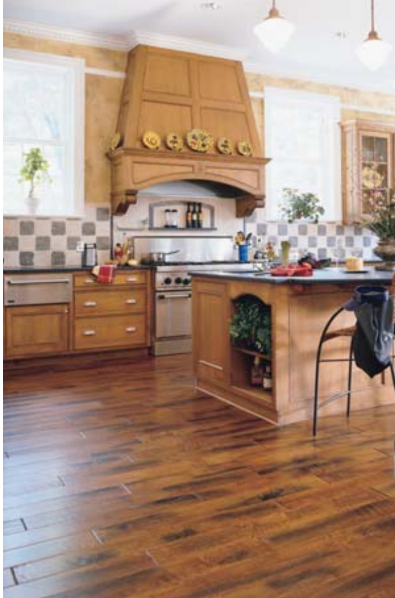
From Carpet One is Anderson's Wood Flooring in Conservatory Plank Maple Brandy.